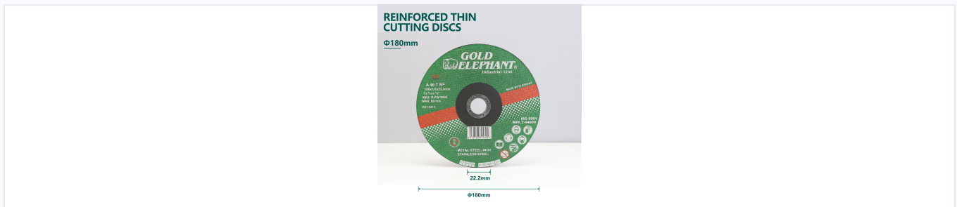
Reinforced thin cutting disc designed for metal, steel, and stainless steel applications.