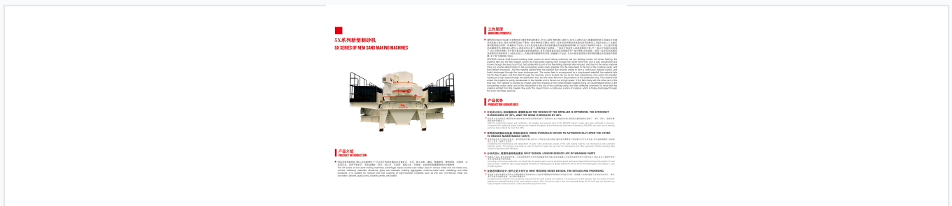
Introduction to the 5X series centrifugal impact crusher highlighting its optimized impeller design and hydraulic maintenance system.