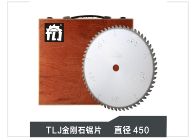
TLJ金刚石锯片 直径 450

This 450mm diamond saw blade is designed for metal cutting applications. It features polycrystalline diamond cutter heads for smooth and efficient cuts.