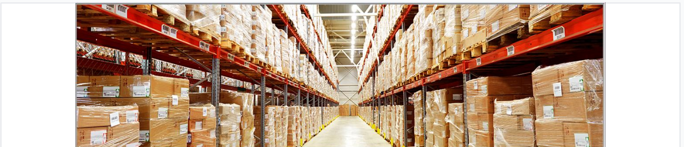
Products are securely packed and stored for international shipping.