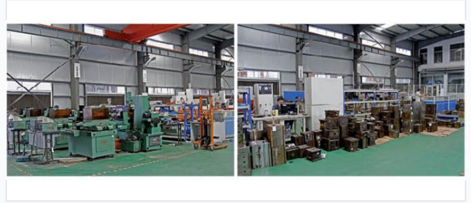
Internal view showing mounting points for 4-pole components.