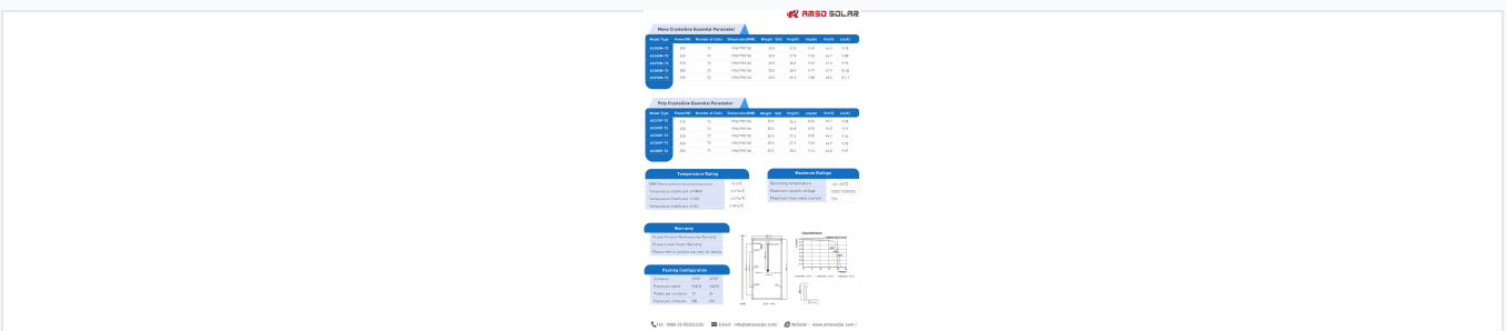
Detailed technical specifications and electrical characteristics for the 390W monocrystalline model.