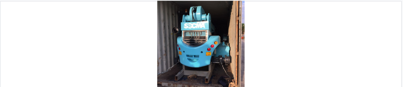
The telescopic boom allows for precise placement of loads in demanding industrial environments.