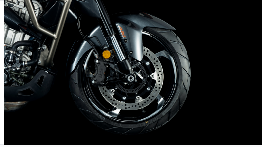
Front assembly featuring inverted forks and high-performance ABS braking.