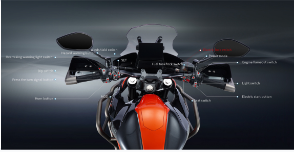
Ergonomic handlebar controls for lights, modes, and windshield adjustment.