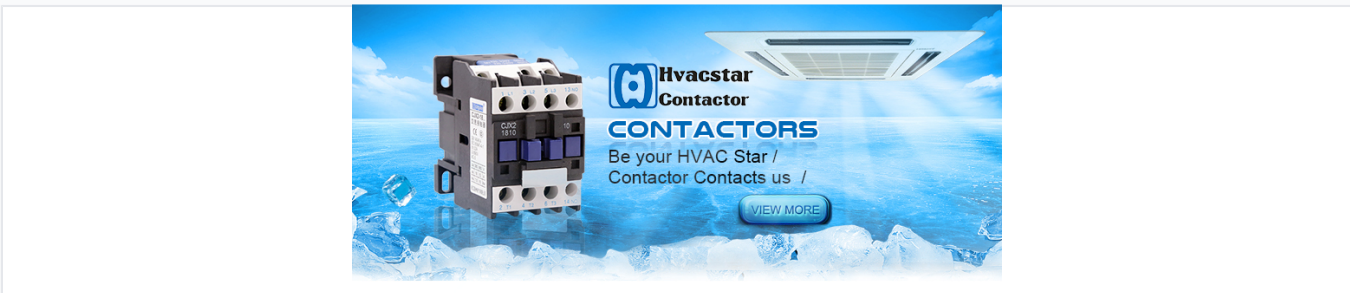
Front view of the 4-pole AC contactor showing terminal configuration and robust housing.