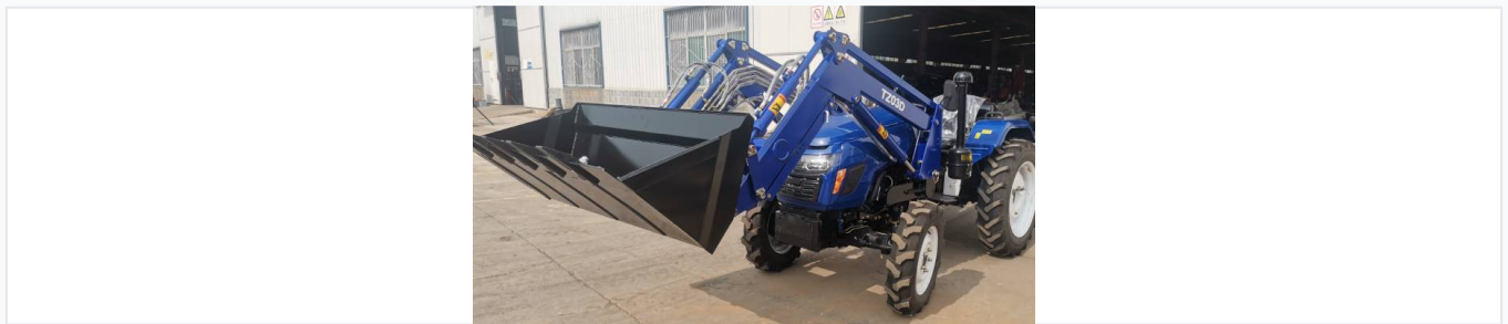
A versatile 30 HP 4WD tractor designed for heavy-duty material handling and farming tasks.