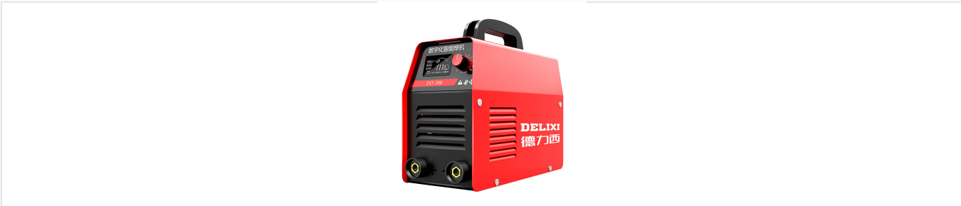
Compact and portable design suitable for professional and DIY applications.