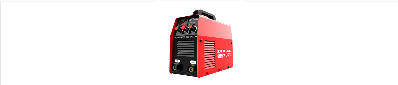
Real-time current display with dedicated knobs for thrust and arc striking current.