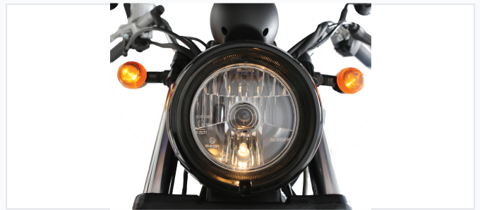
A large vintage and retro-style headlight assembly.