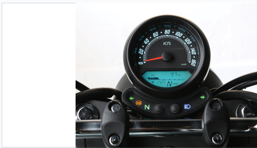
Vintage instrument panel with analog speedometer and multi-functional LCD for high visibility.