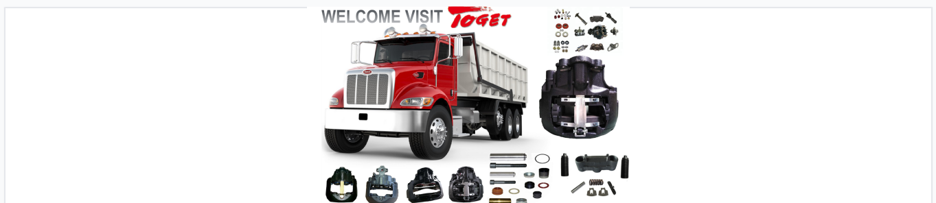
New 22.5 inch air disc brake caliper assembly for heavy-duty vehicles.