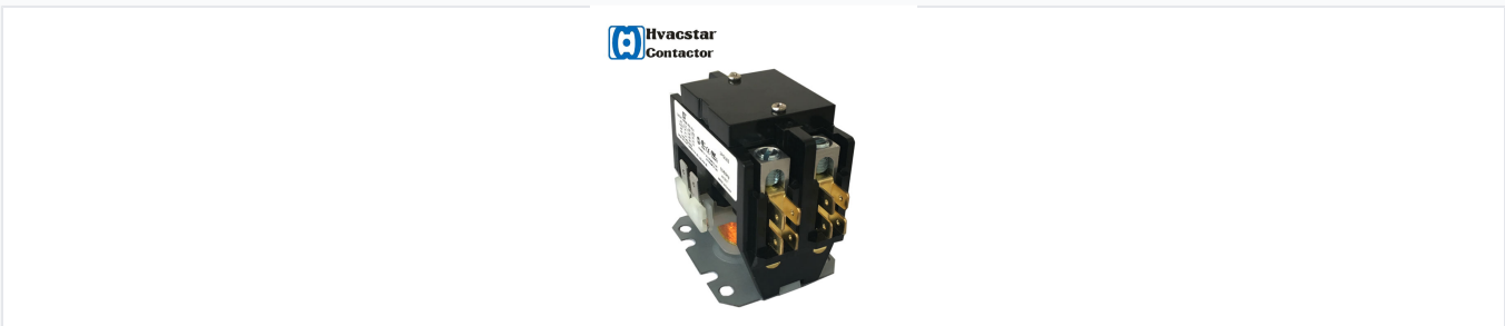
A 2-pole definite purpose magnetic contactor designed for reliable HVAC and refrigeration switching.