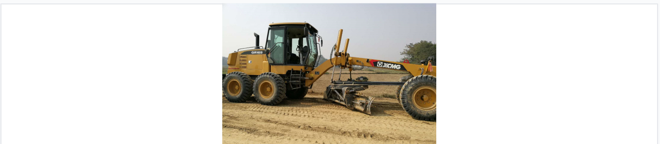
Articulated frame design for enhanced maneuverability.