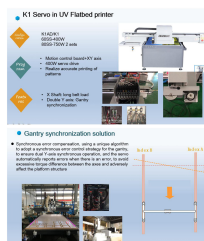
Precision gantry control and dual Y-axis synchronization setup.