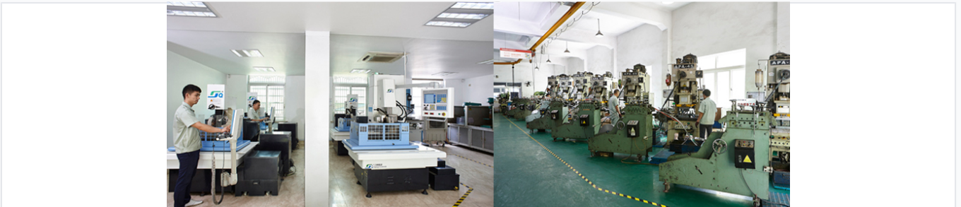
Durable 125A 2-pole molded case circuit breaker construction.