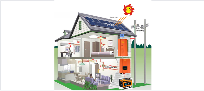
System integration diagram showing solar panels, utility grid, and load connections.