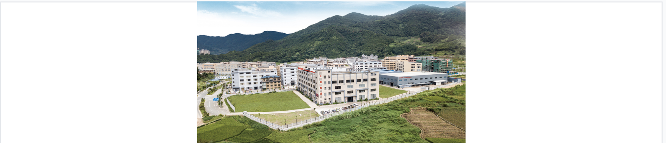
Compact and durable water pumping solution designed for efficient fluid transfer.